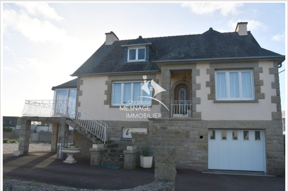
House ref. 389V1984M Dinan

TRELIVAN - Beautiful neo-Breton house of 130m 2 of living space offering: An entrance, a living room with access to the veranda, a kitchen, 3 bedrooms, an office, a bathroom, a toilet, an attic, a workshop with a laundry area, a garage. Outside: a shelter with a fireplace, a courtyard all on land enclosed by a low wall of 805m 2 . Bright house of good construction, close to schools, shops and transport on foot.