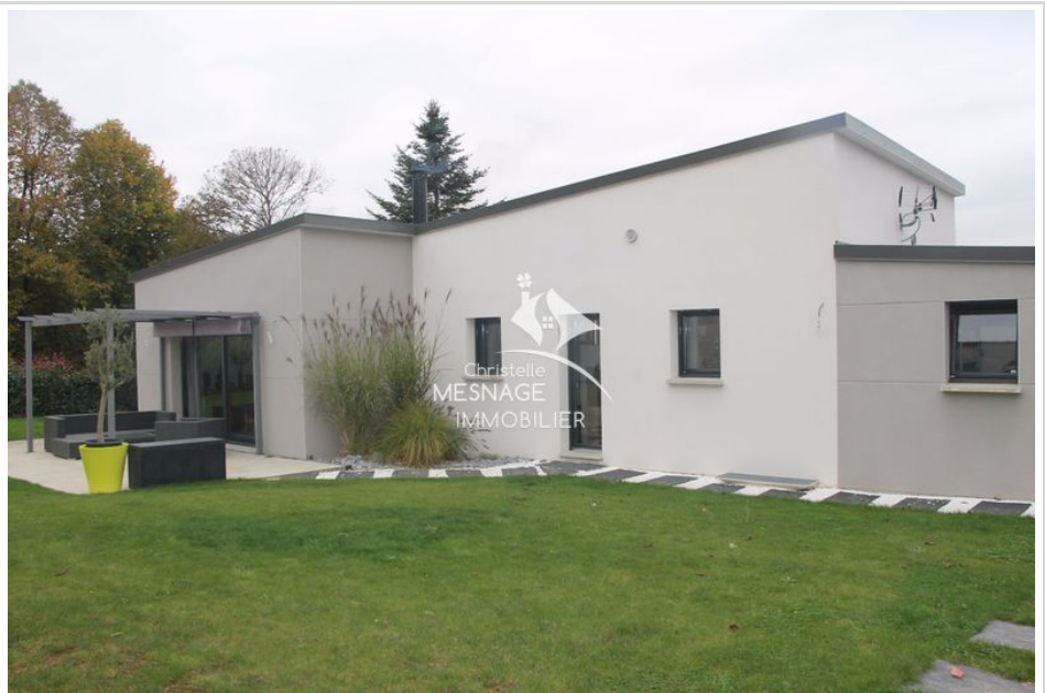
Contemporary house ref. 389V678M Dinan

find all our real estate listings on the website www.christellemesnage.com (houses, flats and land) for sale in Dinan and common léhon nearby quévert, lanvallay, taden, Trelivan, plouer sur rance