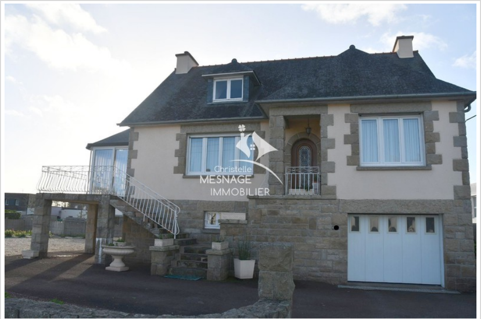
House ref. 389V1984M Dinan

TRELIVAN - Beautiful neo-Breton house of 130m 2 of living space offering: An entrance, a living room with access to the veranda, a kitchen, 3 bedrooms, an office, a bathroom, a toilet, an attic, a workshop with a laundry area, a garage. Outside: a shelter with a fireplace, a courtyard all on land enclosed by a low wall of 805m 2 . Bright house of good construction, close to schools, shops and transport on foot.